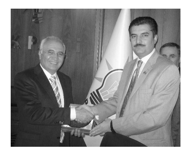
Regular elections in the AK Party are held while for contesting elections, the district parties make the choice.

Mr. Elitas told the delegation in response to a question that the AK Party got 39% votes in the 2007 election and holds absolute majority in the Assembly. The size of the federal cabinet is 26 ministers. Federal Ministers can not hold any other post in the party, he said.