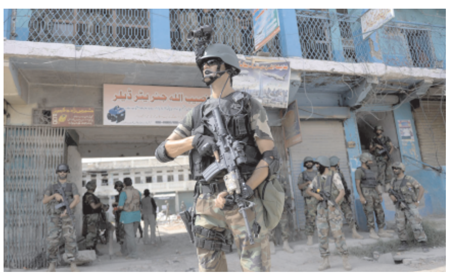
SSG Commando in North Waziristan during Zarb-e-Azb Operation.

June 15, 2015 marked the completion of one year of the Zarb-e-Azb operation undertaken by the Pakistani Military against the militants in North Waziristan. The Military Officials have termed Zarb-e-Azb a resounding success and the primary contributor to the significant drop in acts of terrorism in Pakistan. According to statistics reported by the South Asian Terrorism Portal, civilian casualties from terrorist violence are in decline: dropping 40 per cent in 2014 — the year the operation was launched — to 65 per cent in 2015.13 Moreover, 2,763 terrorists have been killed, 837 militants' hideouts destroyed and 253 tonnes of explosives recovered so far. 14