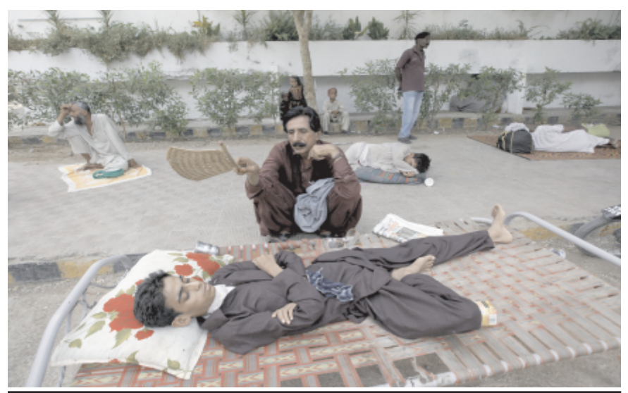
Outside Jinnah Postgraduate Medical Centre (JPMC) during the Heat Wave in Karachi

Apart from the devastation caused by floods, the month of June in Pakistan also witnessed a total of 1000 deaths due to one of the worst heat waves to have struck Karachi. These deaths elucidate the grave water shortage as well as administrative problems that the province of Sindh is facing as 60-65% of people don't have access to clean drinking water. Additionally, the mismanagement and inadequate administration in hospitals was highlighted when hundreds of patients were turned away due to shortage of hospital beds, last month.<sup>39</sup>