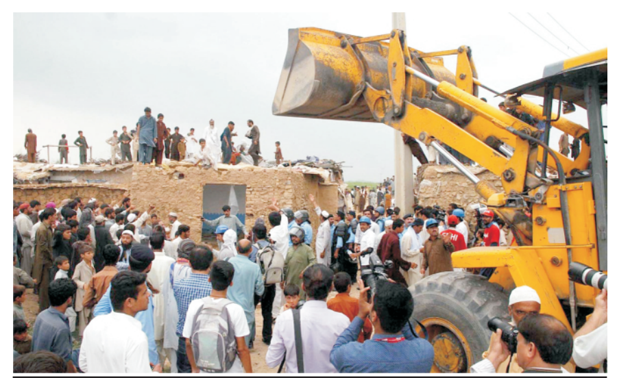
Local residents try to stop bulldozers during the anti-encroachment operation at I-11 Afghan Katchi Abaddi in Islamabad.

The recent razing and eviction of the Katchi Abaddi in I-11 sector of Islamabad has raised massive outcry. The eviction has been dubbed by its critics as an attempt by the Capital Development Authority (CDA) as an opportunity to display its clout and might against the powerless.