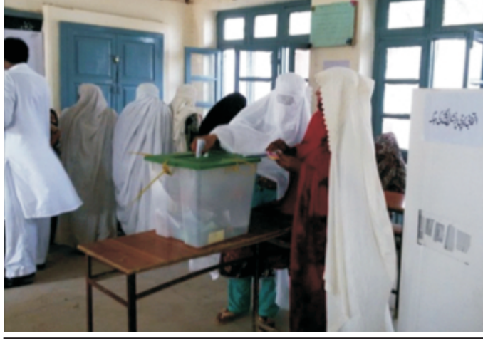
Women Casting their Votes in LG Polls in DI Khan.

Article 140(A) of the Constitution explicitly states, "Each Province shall, by law, establish a local government system and devolve political, administrative, and financial responsibility and authority to the elected