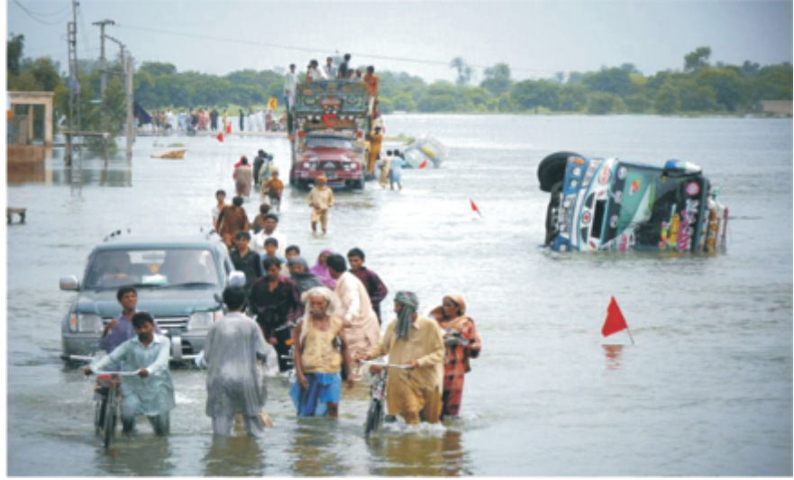
Heavy rains caused flooding and damage in various parts of Chitral Valley.

regards to disaster management and post disaster relief work undertaken so far, the NDMA responded in a timely fashion, with the joint efforts of District and Provincial Authorities and the support of the Pakistan Army. NDMA was also able to mobilize and facilitate the KP Provincial Disaster Management Authority (PDMA) by sending food packages to affected families. For Provincial and District Administration are also taking steps to restore water supply and arrange for temporary basic service delivery mechanisms. Despite the timely relief efforts, the casualties resulting from floods and earthquakes every year is disturbing, which is a cause of concern for Provincial Governments, since it often escalates in to a larger governance crisis.