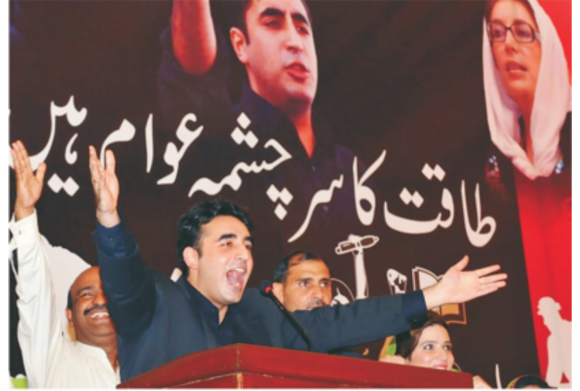
Chairman PPP, Bilawal Bhutto Zardari, addressing a party convention in Bilawal House, Lahore on September 12, 2015