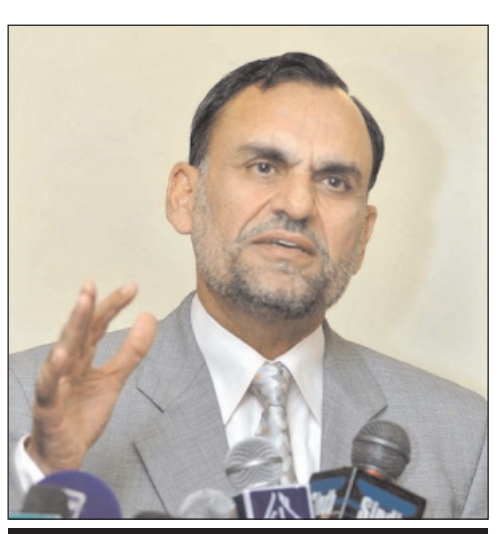
Senator Azam Khan Swati