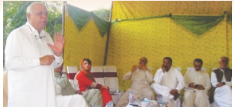
National Party President Senator Mir Hasil Khan Bizenjo addressing members of NP during the party's Central Committee meeting held on May 15, 2016