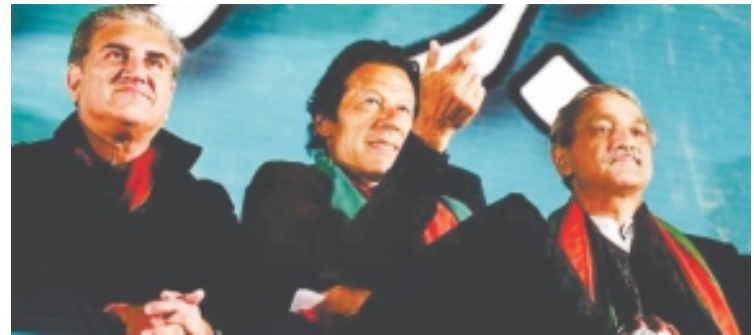
PTI Vice Chairman Mr. Shah Mehmood Qureshi, PTI Chairman Imran Khan and PTI Secretary General Mr. Jahangir Khan Tareen

Prior to the announcement of the postponement of intra-party elections, PTI's former Central Organiser Mr. Jahangir Khan Tareen had announced his withdrawal from playing any part in the intra-party elections. Mr. Tareen's decision came when the party's former National Organiser Mr. Shah Mehmood Qureshi had addressed a Punjab Workers' Convention in Lahore and had announced his support for PTI MNA Mr. Shafqat Mahmood for the post of PTI Punjab President. The party's internal conflicts and challenges came to the forefront when Mr. Qureshi had openly criticised his fellow party leaders Mr. Jahangir Khan Tareen and Chaudhry Muhammad Sarwar for creating rifts within the party. And on June 21, 2016, according to official notifications posted on PTI website, PTI Chairman Imran Khan appointed Mr. Jahangir Khan Tareen as the Secretary General of the party and Mr. Shah Mehmood Qureshi as the Vice-Chairman of the party. It may not be wrong to say now that the PTI has officially failed in its endeavour to hold intra-party elections, as the postponement seems to be for an indefinite period of time or at least until after the General Election due in May 2018.