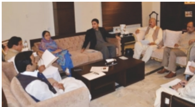
Chairman PPP Bilawal Bhutto Zardari's meeting with the Punjab Coordination Committee

On May 17, 2016, PPP Chairman Bilawal Bhutto Zardari presided over a meeting of the party's newly formed Sindh Coordination Committee at the Bilawal House in Karachi. He asserted that the participation of women, minorities and youth was integral throughout the party's reorganisation process. 1 This reorganisation process commenced last month after the media cell of the PPP released an official notification on April 13, 2016 announcing the dissolution of all bodies of the parties down to the district level. These organisations were consequently replaced with five-member provincial organising committees for each province.