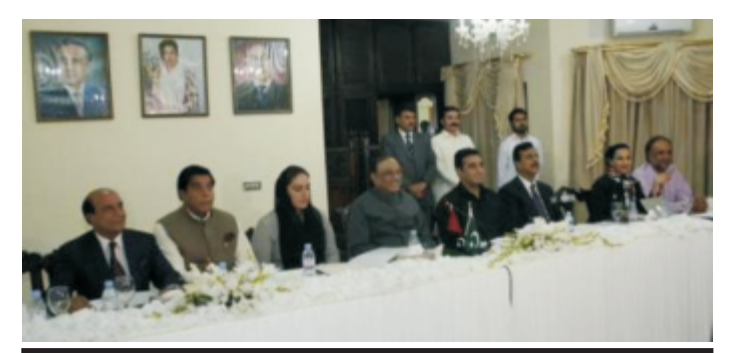
PPP top-tier leaders at the party's CEC Meeting on June 17, 2015 in Islamabad

A key meeting of the Pakistan Peoples Party's (PPP) Central Executive Committee (CEC) took place on June 17, 2015 in Islamabad presided by