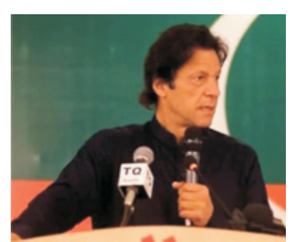
Imran Khan addressing the National Council Meeting on August 2, 2015 in Islamabad

Post this meeting of the National Council, Justice Wajihuddin