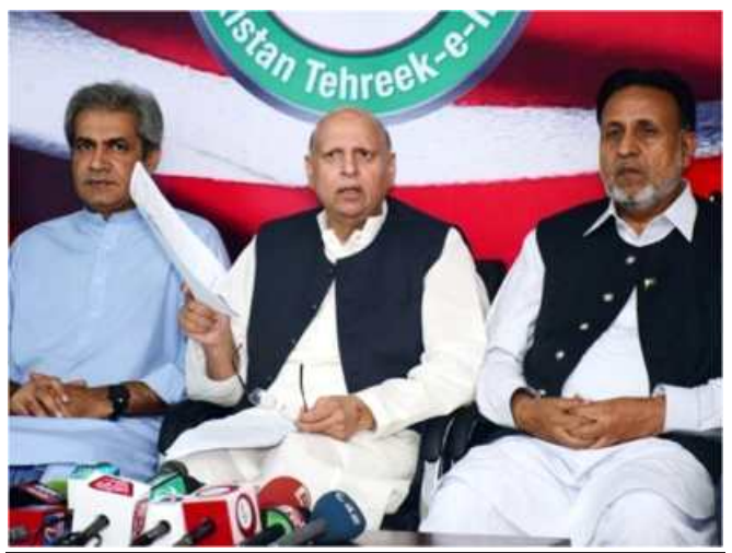
PTI Punjab Organiser Chaudhry Muhammad Sarwar (Centre)

Chaudhry Muhammad Sarwar had joined PTI on February 10, 2015 soon after he resigned as the Governor of the Punjab. He was appointed as PTI organiser in Punjab only 3 months later. According to Section 5 of the Political Parties Order of 2002, a person cannot be appointed or serve as an office-bearer of a political party if he is not qualified to be, or is disqualified from being, elected or chosen as a member of the Parliament under Article 63 of the Constitution of Pakistan. Article 63 (k) states that a