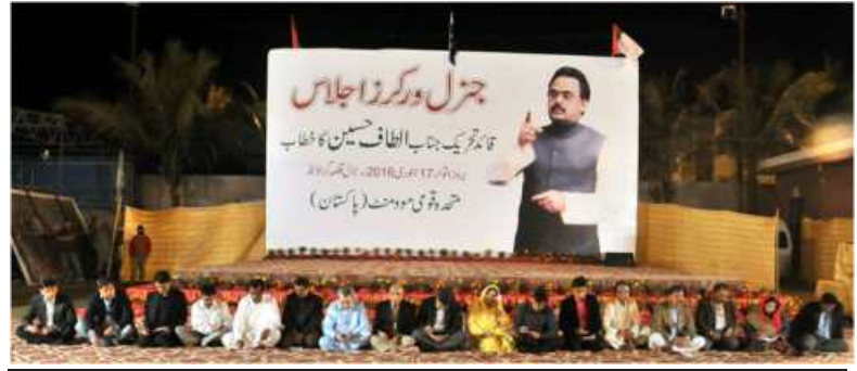
MQM workers gathered to listen to their party chief's announcement of the constitutional amendment

It was reported in the media that objections to terms 'Unit' and 'Sector' were made as the terms were also used by the Pakistan Army. However, the change is also aimed at harmonising the basic party structure with the city's local government set-up in order to bring improvement to the overall working of the party.<sup>8</sup>