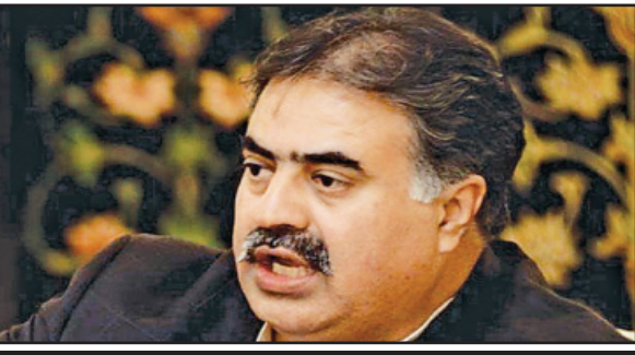
Nawab Sanaullah Khan Zehri, new Chief Minister of Balochistan

On December 10, 2015, Prime Minister Nawaz Sharif announced the nomination of Nawab Sanaullah Zehri for the post of Chief Minister Balochistan and on December 23, 2015, he was elected in the Balochistan Assembly unanimously. Although a meeting of all important stakeholders under the Murree accord took place that was presided by the Prime Minister himself before it was decided to put Nawab Sanaullah Zehri in the said position, it is not clear if any internal party meetings of the PML-N took place for the purpose of selecting the new Chief Minister of Balochistan.