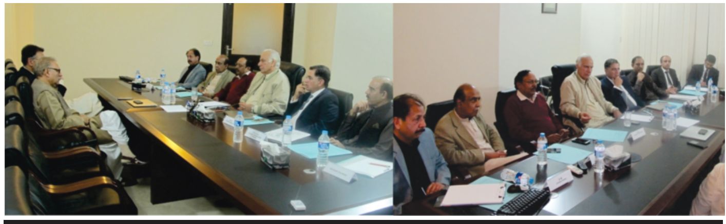
Meeting at the PTI Election Commission Office on December 9, 2015

On December 30, 2015, the PTI Election Commission released a test registration procedure, which is indicative of the fact that the party is working diligently to hold internal elections in a serious manner so as to avoid irregularities based on lessons learnt in the previous party elections<sup>14</sup>.