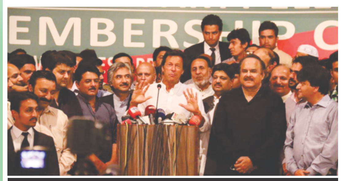
PTI Chairman Imran Khan addressing his party members and supporters

On April 11, 2016, PTI Chairman Imran Khan announced at a press conference in Islamabad that the party's intra-party elections have been postponed in view of the circumstances created by the leaks of the Panama papers. As reported by the media, a meeting of the party's Central Advisory Council had taken place on the same day after which it was decided that the elections would take place after the PTI had concluded its march onto Raiwind. The date for the march has not yet been announced, however, the purpose is to protest against the Prime Minister of Pakistan, Muhammad Nawaz Sharif's family's undeclared assets and offshore companies. All party activities pertaining to the intra-party elections of PTI have been stopped except for the membership campaign.