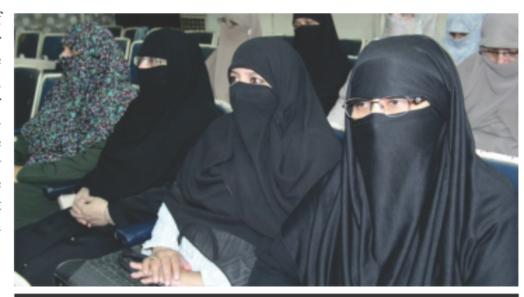
Female elected members of the Jamaat-e-Islami's Central Consultative Council

A ground-breaking amendment was made in the constitution of the Jamaat in October 2015 in which 10 seats were allocated for women in the party's Majlis-e-Shura or Central Consultative Council. This was a strong break from tradition for the party, giving effective representation to women, that has come under the leadership of the current Amir of the Jamaat, Senator Sirajul-Haq. On April 26, 2016, the first meeting of the Shura in the presence of 10 elected women members took place for a 3-day sitting of the body. A total of 5000 women ' Arakeen ' of the Jamaat elected these 10 female Shura members through secret balloting. Arakeen are those members of the Jamaat who can exercise the right to vote in the party elections.